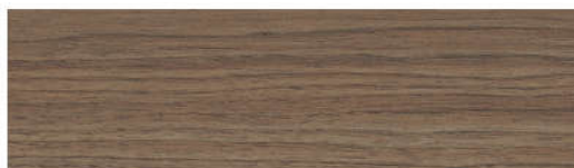
256 NOCE SAVOIA