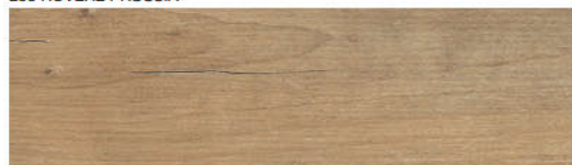
254 ROVERE SLAVONIA