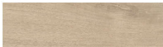
255 ROVERE PRUSSIA